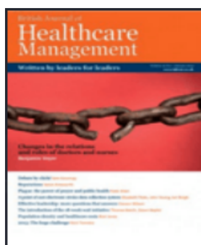
British Journal of Healthcare Management