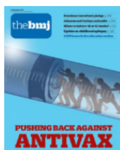
The British Medical Journal