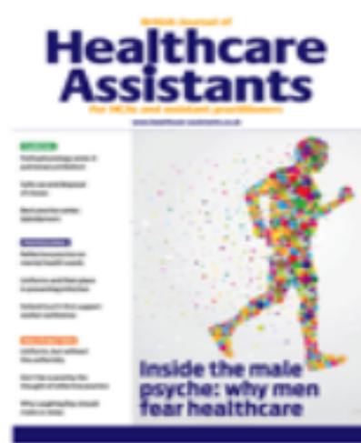
British Journal of Healthcare Assistants

You have access to online journals using your OpenAthens details. You can browse journals using the NHS Knowledge and Library Hub . Here are some of the journals available to you.