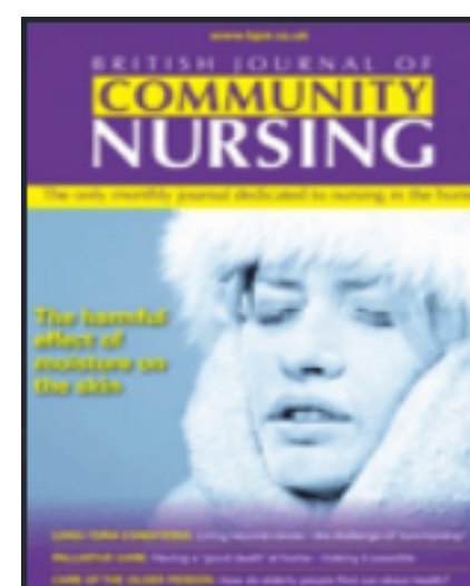
British Journal of Community Nursing