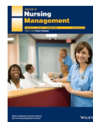
Journal of Nursing Management