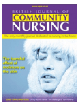
British Journal of Community Nursing