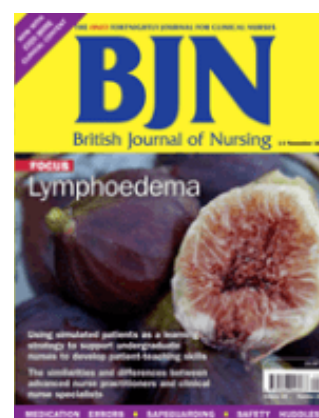
British Journal of Nursing