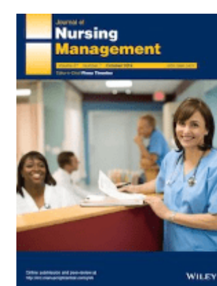
Journal of Nursing Management