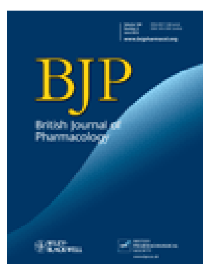
Br. J. of Pharmacology