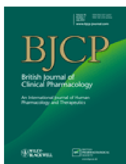
Br. J. of Clinical Pharmacology

You have access to online journals using your OpenAthens details. You can browse journals using the NHS Knowledge and Library Hub . Here are some of the journals available to you.