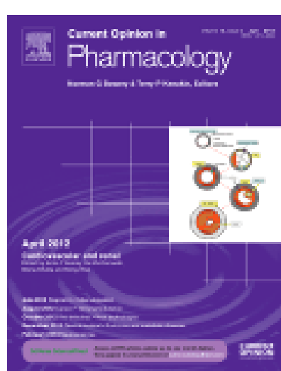
Current Opinion in Pharmacology