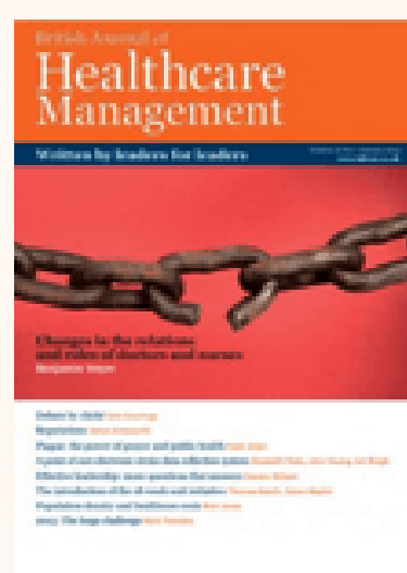
British J. of Healthcare Management