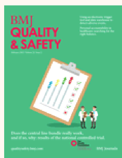
BMJ Quality & Safety