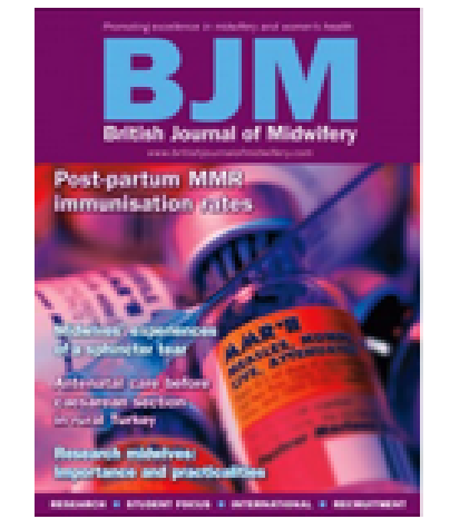
British Journal of Midwifery