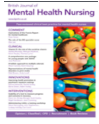
British Journal of Mental Health Nursing