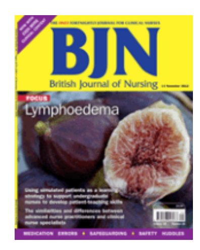
British Journal of Nursing

You have access to online journals using your OpenAthens details. You can browse journals using the NHS Knowledge and Library Hub . Here are some of the journals available to you.